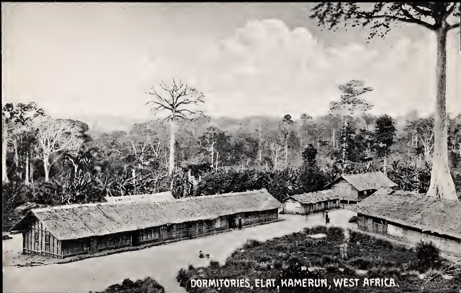
DORMITORIES, ELAT, KAMERUN, WEST AFRICA.